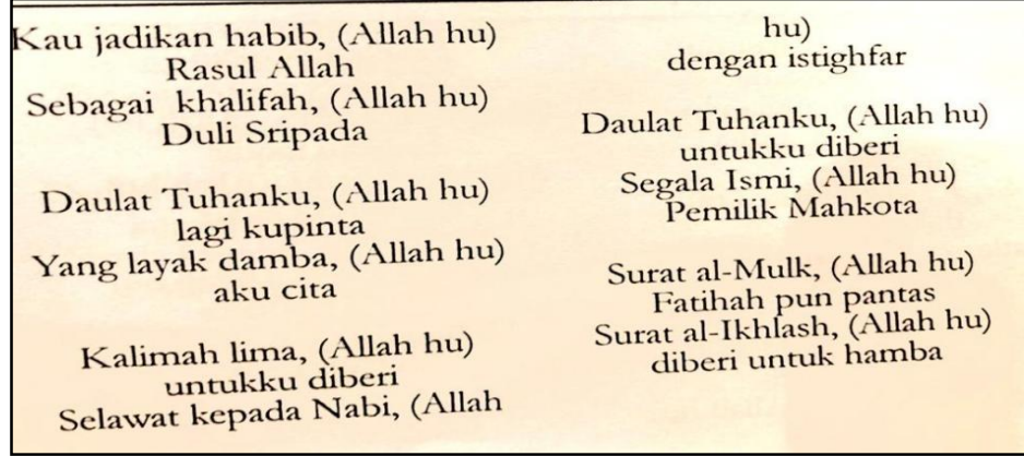
Picture 2. Taken in the book Munajat Perempuan Sufi Aceh page of 79-80.