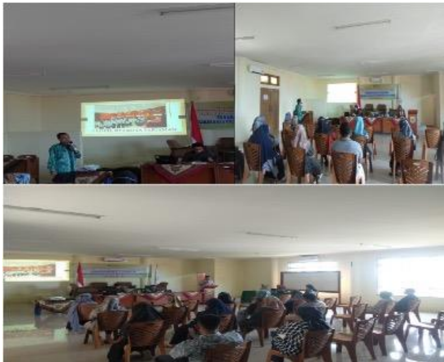
Figure 1. Assistance for The Bride-To-Be alumni at BP4 Pariaman City.