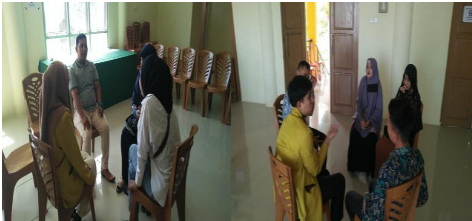
Figure 3. Using the Gestalt Approach.

If that happens to F's household, F must be able to react, not when her husband's business is declining, F must provide support and support and mutually solve the problem because if F always provides support and support, the husband will also be enthusiastic about finding solutions and getting out of the problem, because it is with support and support from the wife that the husband can be enthusiastic, but if when the husband's business is declining, the wife is angry with the husband and does not provide support but instead urges and pressures the husband, then it is not the problem that is solved but the great quarrel in the household that occurs. Therefore, if indeed the F husband's business decreases, F must provide support and support and jointly look for solutions to the problem, then the problems that F and her husband face will be resolved and domestic quarrels will not occur and the husband will love F even more because in difficult circumstances F always supports and looks for solutions together and the F family will always be a family that is sakinah, mawaddah wa rahmah . 15