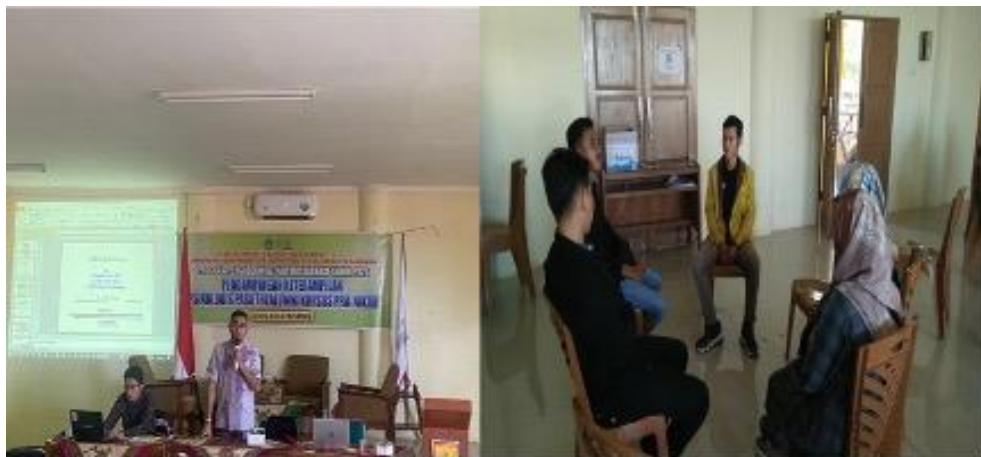
Figure 2. Psychological Strengthening through family counseling.