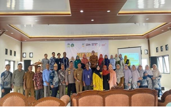
Figure 7. Moment of the Announcement of the Draft Qanun Ratification and the Miruk Taman Inclusive Village Declaration.

The direct involvement of persons with disabilities in the declaration of Miruk Taman as an Inclusive Village is a joint initiative to eliminate the stigma of disability as a marginalized group. The Declaration of the Disability Inclusive Village of Miruk Taman can be seen as the village apparatus and KSM's preparedness in addressing the needs and