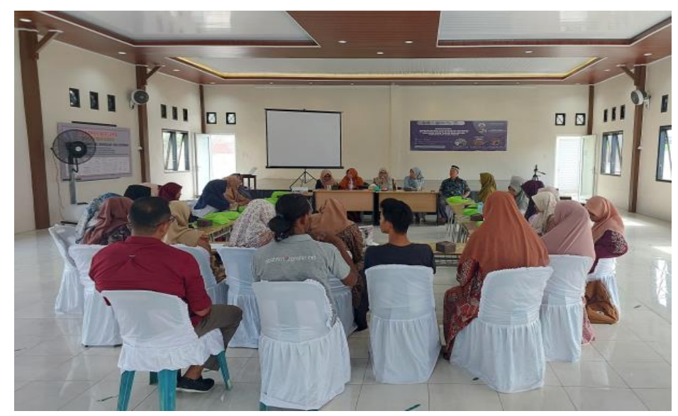
Figure 1. Interactive Dialogue on Awareness and Capacity Building of KSM and Village Apparatus Regarding Legal Legitimacy.

The activity above is part of the support provided to Gampong Miruek Taman to realize an Inclusive Village. In this case, the strengthening efforts are not only directed at persons with disabilities but also at village apparatus and KSM as the technical implementers at the village level. Internally, the mission of strengthening the village apparatus in realizing an inclusive village is also greatly influenced by the potential of the persons with disabilities themselves, as their motivation and desire to participate will significantly support the needs and rights of persons with disabilities.