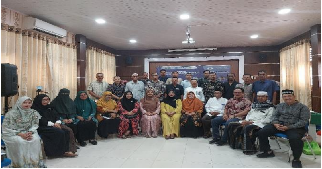
Figure 3. Strengthening and Assisting the Formulation of a Qanun for Persons with Disabilities in Miruk Taman.

The initial groundwork for the Qanun formulation began with a program to form the KSM. On one hand, Miruk Taman village is one of the villages with the highest number of persons with disabilities, totaling 17 individuals. This led to support for drafting the Qanun on disabilities. With the potential within the village and the networking through Tuha Peut, an initiative was undertaken. Thus, a Qanun draft was created through a workshop involving relevant stakeholders.