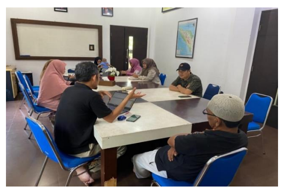
Figure 6. Preparation for the Disability Inclusive Village Declaration in collaboration with FBA, Village Head, and Village Chief.

d. Miruk Taman Disability Inclusive Village Declaration as the Moment of the Enactment of the Disability Qanun in Miruk Taman Village