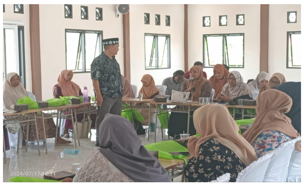
Figure 2. Interactive Dialogue on Capacity Building of Legal Structure, Legal Substance, and Legal Culture.

Through the interactive dialogue conducted, it was found that before the draft disability qanun was prepared, the village had already indirectly provided special attention to persons with disabilities. The village apparatus considers that providing attention to persons with disabilities is an obligation to ensure their rights and equal services. Starting from the need to be recognized and live a dignified life like other community members, the legal product to be implemented in specific programs must be formulated and firmly established. This legal determination will, of course, adjust to how the legal culture has evolved in Indonesia, specifically in the Aceh province.<sup>19</sup>