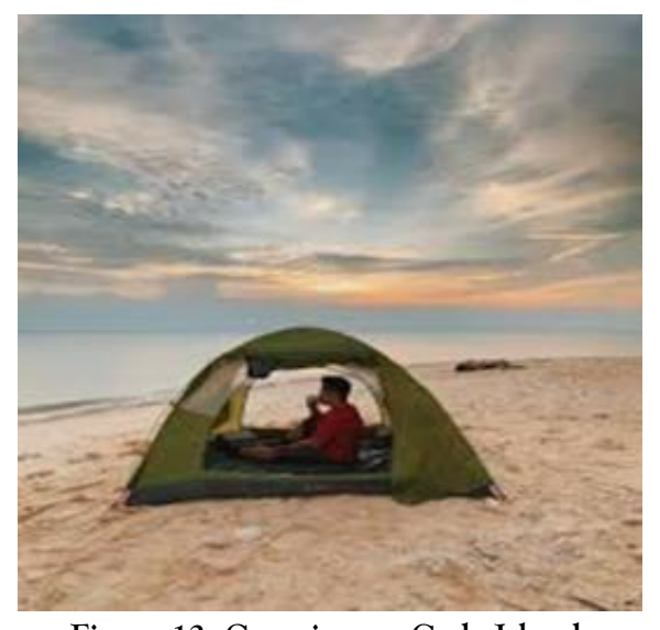
Figure 12. Camping on Gede Island.

In addition to the natural beauty and tourism activities, the local wisdom of the community also serves as an added attraction for visitors. The traditions, culture, and unique culinary offerings of the local people can enrich the tourist experience. Interviews with local residents revealed their willingness to showcase their culture, including traditional dances and signature culinary dishes, to visitors. Integrating local wisdom into tourism development not only enhances the visitor experience but also supports cultural preservation. By involving the community in the development of the tourist village, a sense