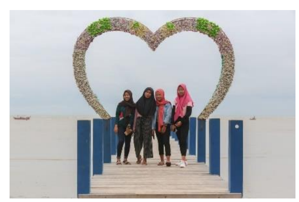
Figure 4. Dermaga Cinta (Love Pier).

Tourism activities at Pasir Putih Beach Wates are diverse, offering a variety of engaging experiences for visitors. Guests can enjoy activities such as swimming, playing in the sand, using swings, visiting the treehouse, camping, and exploring the nearby small islands. Interviews with visitors reveal a high level of satisfaction with their experiences at the beach, as they find the activities offered to be diverse and enjoyable. This aligns with previous research findings, which highlight that the variety of tourism activities plays a crucial role in attracting visitors. In the case of the property of tourism activities plays a crucial role in attracting visitors.