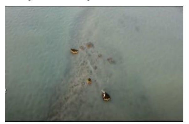
Figure 2. Photo of Marongan Island.