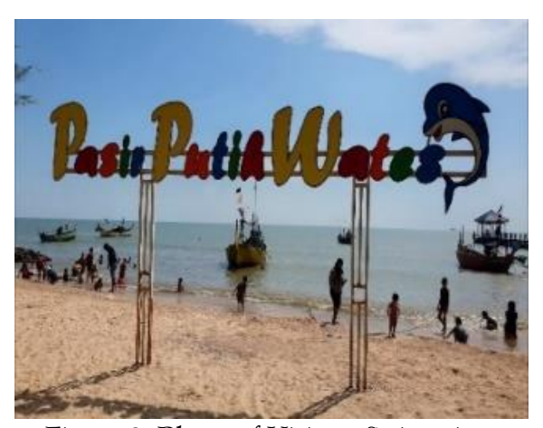
Figure 8. Photo of Visitors Swimming.