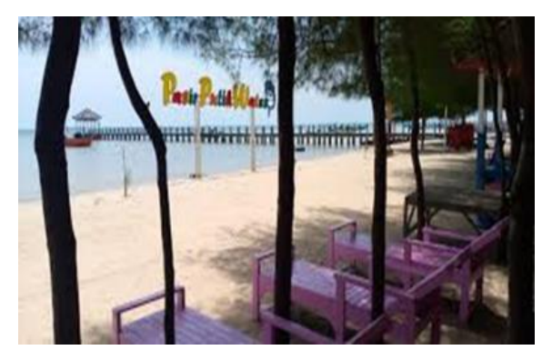
Figure 11. Atmosphere at Pasir Putih Beach Wates.