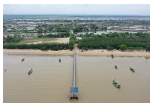
Figure 1. Dermaga Cinta (Love Pier).

Field observations reveal that many visitors enjoy the beach atmosphere, particularly during sunset, when the natural panorama becomes exceptionally breathtaking. This natural beauty serves as the primary attraction that can boost tourist visits and contribute positively to local economic growth. The visual appeal and natural charm act as a magnet for visitors, creating opportunities to generate income for the local community.<sup>29</sup>