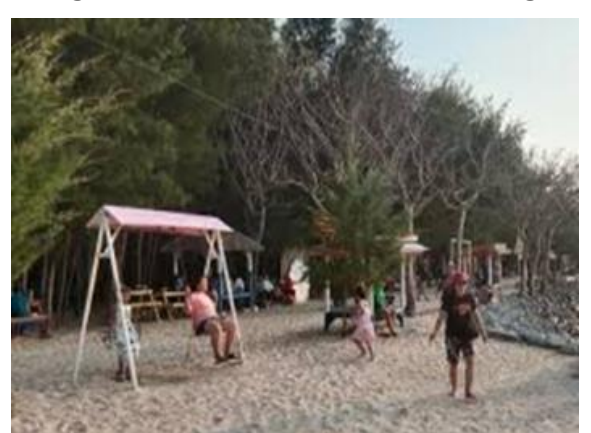
Figure 9. Photo of Visitors Enjoying Swing Facilities.