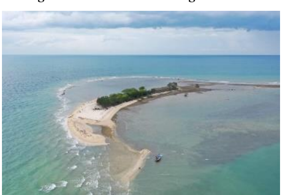
Figure 3. Photo of Gede Island.