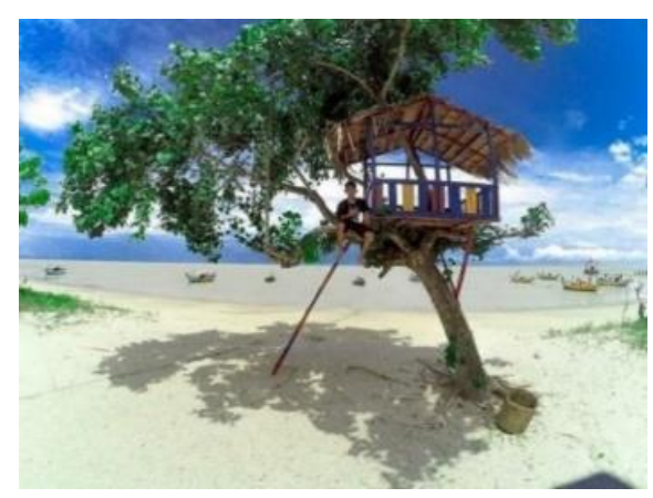
Figure 10. Photo of the treehouse at Pasir Putih Beach Wates.