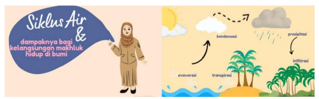
Figure 3. Animated Video for Water Cycle Topic in Fifth Grade of Elementary School

Furthermore, the completed animated media underwent evaluation and received assessments and feedback from subject matter expert and media expert to measure its validity. The animation video that has been developed can be seen in Figure 3.