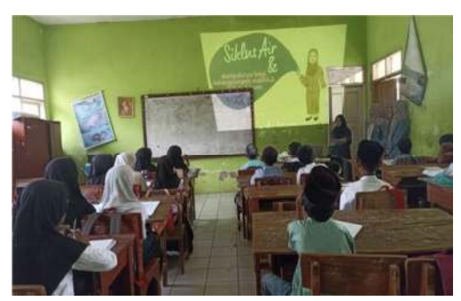
Figure 4. Implementation Animated Video for Water Cycle Topic in Fifth Grade of Elementary School

The next step was the implementation phase, where the developed animation media was tested in the learning process. This learning process involved 25 fifth-grade elementary school students. The learning process commenced with an introductory session, followed by the core activity, which included playing the instructional video, and concluded with a closing session. After utilizing the animated video, the students were asked to fill out a response questionnaire to gauge their feedback regarding the use of video animation media in science lessons, specifically focusing on the water cycle material. This questionnaire aided in assessing the practicality level of the video animation media. Implementation activities that have been carried out can be seen in Figure 4.