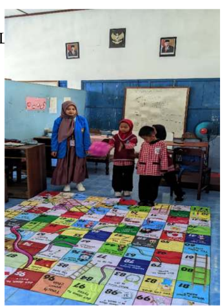
Figure 4. Play Guess Vocabulary

With activities such as playing guessing students can be more active in improving understanding of vocabulary effectively games.