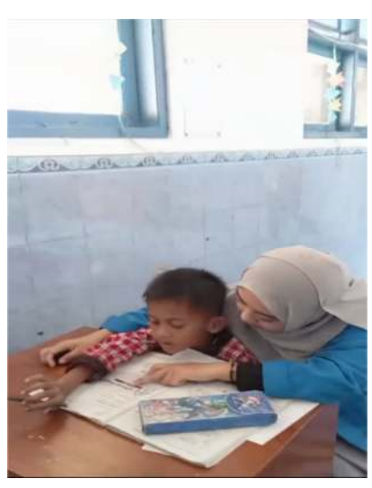
Figure 2. Train Students to Read

The picture shows that there is a practice activity with students to importance of skills and mastery in meaning of the vocabulary given.