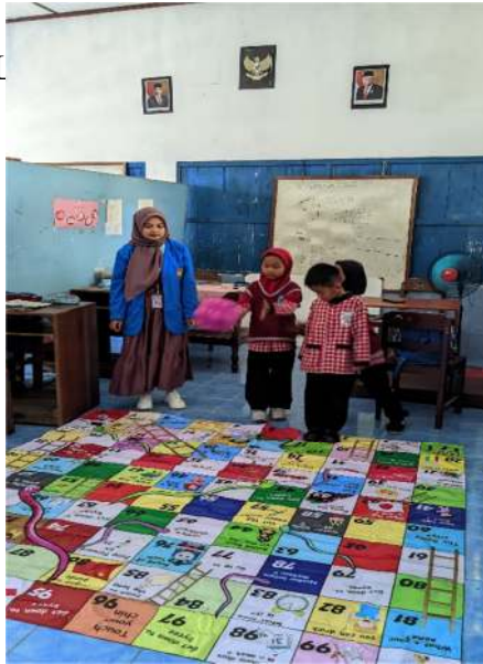
Figure 3. Vocabulary I