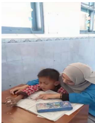
Figure 2. Train Students to Read

The picture shows that there is a practice activity with students to importance of skills and mastery in meaning of the vocabulary given.