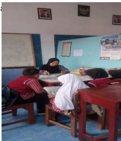
Figure 1. Vocabulary Learning

The picture on the side shows the existence of direct teaching and learning activities in the classroom. This proves that there is direct interaction between teachers and students to increase students' interest in learning English.