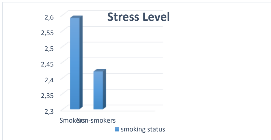
Figure 2. Perceived Stress Level

An independent-samples t-test was conducted to compare the perceived stress level for smoking and non-smoking adolescents. There was a significant difference in the stress level for smoking adolescents ( M = 2.59, SD = .21 ) and non-smoking adolescents [ M = 2.42, SD = .39; t(79) = 2.76, p < .05 ]. The magnitude of the mean difference was significant, though moderately small (eta squared = .068)