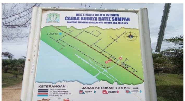
Figure 1. Map to Batee Sumpah

In the past, Batu Tengku Diba'tee played a crucial role in resolving disputes within the community. According to local tradition, individuals involved in conflicts were required to swear an oath before the stone as a means of proving their honesty (Yansah, 2021). The community believes that the stone is guarded by a mystical entity in the form of Tengku Diba'tee , a supernatural crocodile said to possess metaphysical powers capable of punishing those who lie. This belief is rooted in oral traditions passed down through generations, including stories of crocodile sightings around the swamp where the stone is located. The reverence for Batee Sumpah remains strong to this day, reflecting the moral and spiritual values that continue to shape the social fabric of the Seuneubok Padang community.