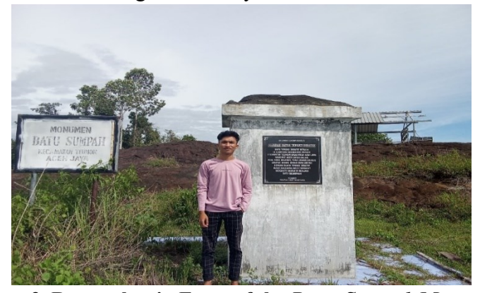
Figure 3. Researcher in Front of the Batee Sumpah Monument

From this statement, it can be concluded that the younger generation plays a crucial role in preserving the continuity of the Batee Sumpah tradition. Through their involvement, this tradition not only remains alive but also undergoes a regeneration of the noble values embedded within it. By ensuring its preservation, Batee Sumpah continues to serve as a significant symbol in maintaining the spiritual, social, and cultural balance of the Seuneubok Padang community.