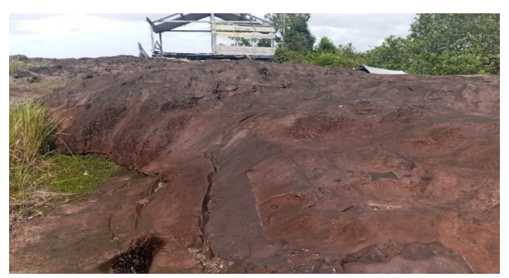
Figure 2. Tengku Diba'tee Stone (Batee Sumpah)