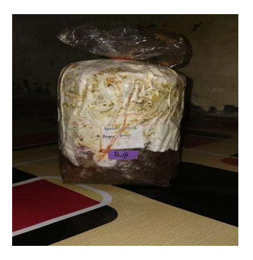
Figure 2. Mycelium growth

mycelium. oyster mushroom The growth rate of mycelium is influenced several factors, by namely environmental factors in the form of Ph, temperature, light intensity and humidity required by mushrooms of around 90%[12]. The level of bag log density also influences the speed of mycelium growth. The denser the bag log, the longer the mycelium will propagate in the bag log. Other factors include the quality of the white oyster mushroom seeds and the water content in the bag log.