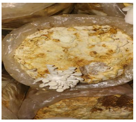
Figure 2. Pinhead Appears

In this study, the bag log was positioned horizontally and had various lengths. It could be that the time and number of pinhead appearances are not the same.