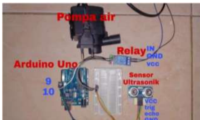
Figure 3. Relay Design to Arduino Uno

Relay is a device with an actuator consisting of coils of copper wire that acts as an electronic switch. A magnetic field will develop in the iron core as a result of the copper coil on the iron core with a 5 volt power source on both ends. This enables the relay to be employed in the construction of this tool as a switch to turn on other electronic components [14].