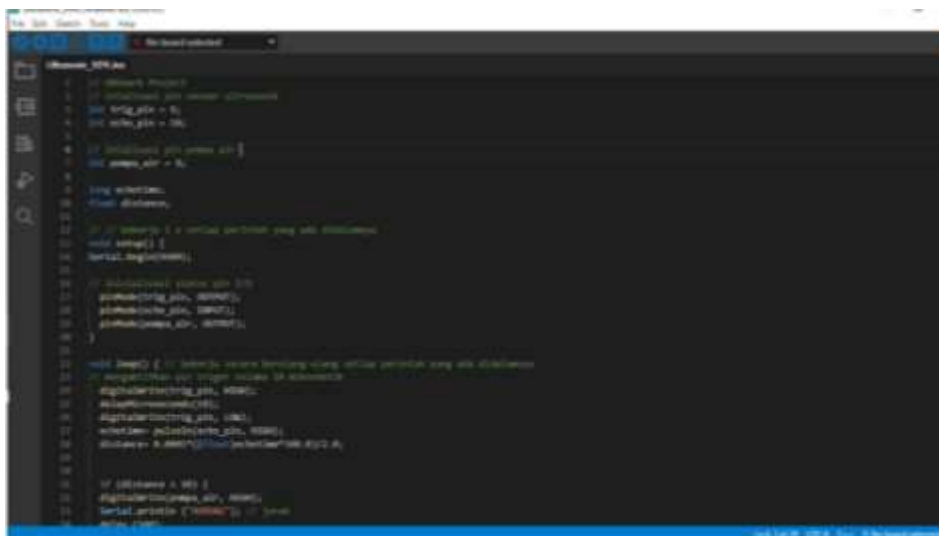
Figure 6. Display of the Program in the Arduino IDE Software

Programming is done with the intention of loading a program that will carry out the programmer's instructions. The programming process for the HC-SR04 ultrasonic sensor makes use of a program that will be controlled by an Arduino uno board and makes sure that the program developed with the Arduino IDE software can be run in accordance with the previously planned design. There is an Arduino IDE display, as seen in Figure 6.