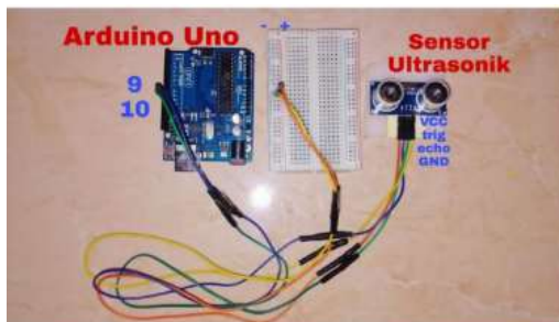
Figure 2. Ultrasonic Sensor Design