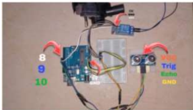
Figure 5. Ultrasonic Sensor Design With Supporting Components

The explanation behind Figure 5 above is as follows: