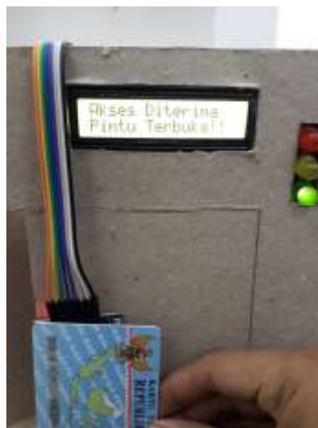
Figure 3. Access Accepted View

Trial process of E-KTP Registration using Admin card. This process requires one e-KTP as an Admin that functions for registration and deletion. This test was conducted with 7 e-KTPs with several repeated trials, here is the appearance of the tool when conducting several tests: