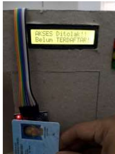
Figure 4. Access Denied Display

Observational assessment of the results of the door safety prototype design are as below. From the Table 3, shows the observation results of the prototype design, indicating that the design is highly suitable for the intended needs (score: 5), although improvements are needed in aesthetics and safety (score: 3).