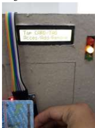
Figure 7. Display During the Registration/Deletion Process

For Registration and Deletion of e-KTP on the LCD prototype will display "Access/Add/Remove" as a sign of registration or deletion to be carried out, and the Yellow LED will light up, and confirmed using the Admin Card. The display on the prototype when registering/deleting e-KTP can be seen in Figure 7.