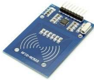
Figure 1. RFID RC 522

RFID has a chip that can store data in the form of an ID number and functions to transmit data to the RFID reader via radio waves emitted by the reader [13]. An IT infrastructure that enables application development and offers RFID device and data administration is necessary due to the widespread use of radio frequency identification (RFID) systems in application domains [14]. The antenna on the RFID tag (tag antenna) and the RFID reader (reader antenna or interrogator) function to transmit data from the RFID tag chip to the RFID reader via radio waves. For HF (13.56Mhz) there are many tags available, for example RFID RC522 MIFARE. The reading distance is limited, but the available memory is much higher. Starting from 384 bits, up to 8 kbit. The additional components in this prototype design such as Solenoid which functions as a door lock, Relay module functions as an electric switch that can work automatically according to the given logic command., also LCD or Liquid Crystal Display is a type of display media that uses liquid crystals to produce visible images.