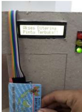
Figure 5. Display When Access is Accepted

When the e-KTP is not registered, access will be denied and the LCD Prototype will display "Access Denied Not Registered" and the door will remain locked, as can be seen in Figure 6.