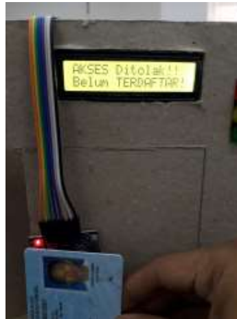
Figure 6. Display When Access is Denied

When the e-KTP is not registered, access will be denied and the LCD Prototype will display "Access Denied Not Registered" and the door will remain locked, as can be seen in Figure 6.