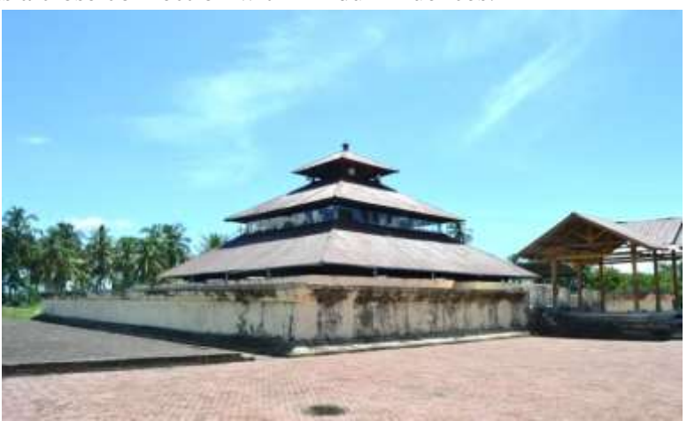
Figure 1. Masjid Tuha Indrapuri (sources: Putra, 2018)

This mosque was built on an area of 33,875 square meters using the wooden material. The construction is supported by 4 main pillars (that in terms of Javanese architecture known as "Soko Guru") with the shape of an octagonal cross section. The construction of these main pillars serves as the main support for the roof structure. This mosque uses three stacked roofs like pyramids which are getting smaller as getting to the top. This roof shape in terms of architecture certainly has a close connection with Hindu influences.