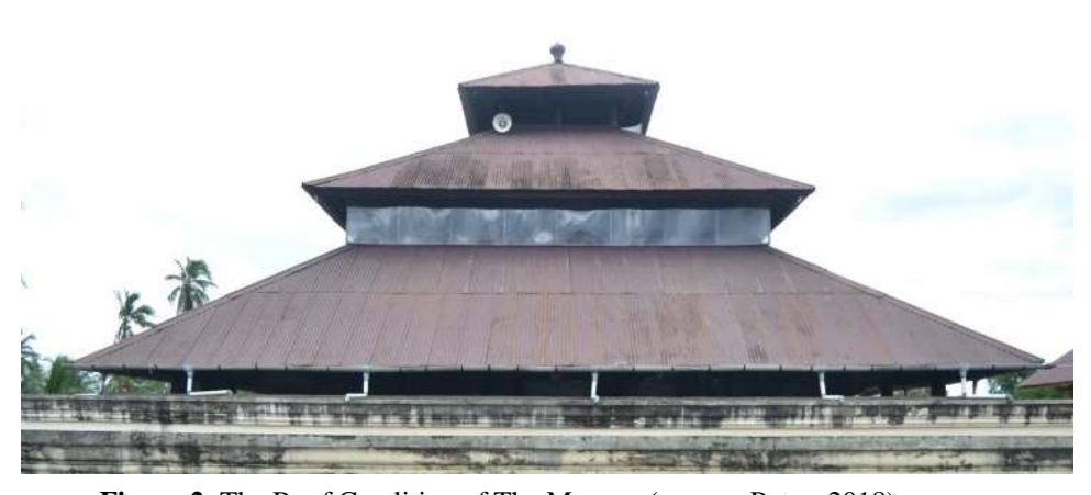
Figure 2. The Roof Condition of The Mosque

At the same time, the utilities section which consists of lighting, air conditioning, and water availability appear to be in excellent shape. The existence of utilities, even though they are small in weight, yet are very supportive for the convenience of the users, most of all because this is a mosque building that have always been used for the implementation of five daily prayers. Therefore, there is no decrease in robustness for the utilities part.