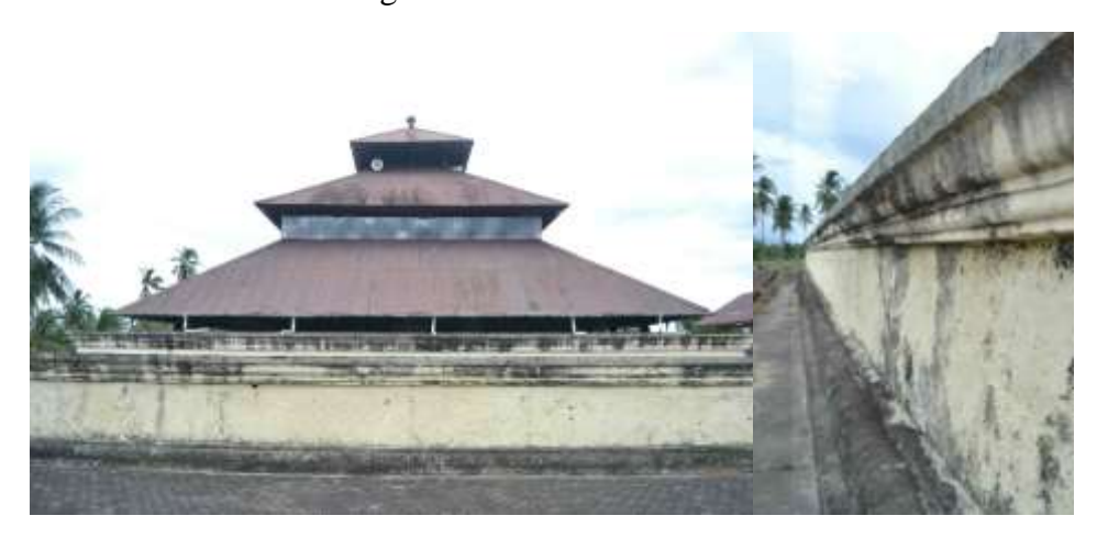
Figure 4. The View of The Mosque (left) and The Condition of The Mosque Walls (Right)

The other construction components which also experience a decrease in robustness are walls, namely 20%. The walls of the mosque are made of concrete, from the observations in the field, the condition of the walls is not too well maintained, many parts of the wall shows that the paint has peeled off and covered by moss. The wall plastering also seems rough, although there are no cracks that can affect the strength of the structure.