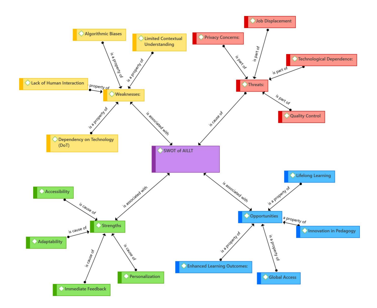
Figure 2. The analysis SWOT of AILLT

lifelong learning, innovative teaching methods, improved learning outcomes, and global reach.