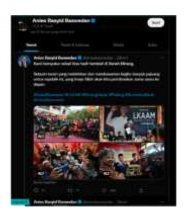
Figure 1: Pictures of activitiy