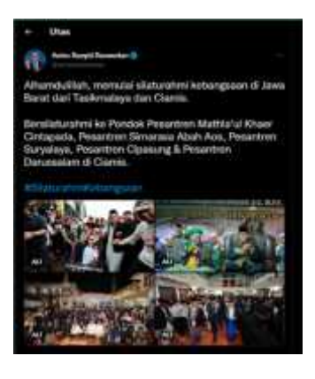
Figure 08: Text and religious symbols