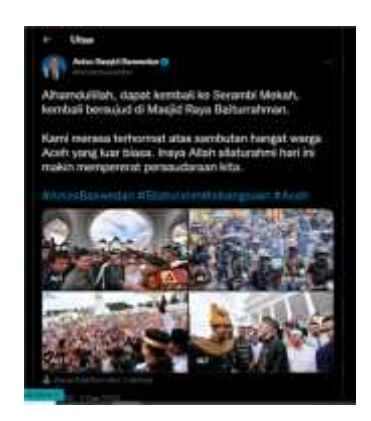
Figure 07: Text and religious symbols

In another post, Anies Baswedan published his activities with scholars, preachers, and several other religious organizations. As shown in figure 04, the Twitter account displays prayer activities at the #jakartabersholawat event. The post displays two photos consisting of a photo of Anies Baswedan with KH. Syukron Ma'imun, Sheikh Abdul Qadir Assegaf, and several other religious leaders. Figures 05 and 06 describe Anies Baswedan helping the people who attended the activity. The connotative means of the picture describes Anies Baswedan's approach to several scholars persuasively. Approach to the clergy and preachers as a means to gain the votes of their followers ( jama'ah ). Meanwhile, this assumption is reinforced by the narrative text, which shows an atmosphere of joy from Anies Baswedan for holding activities with religious leaders and the community.