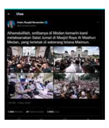
Figure 06: Pictures of activities