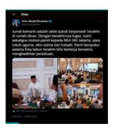
Figure 05: Picture of activity