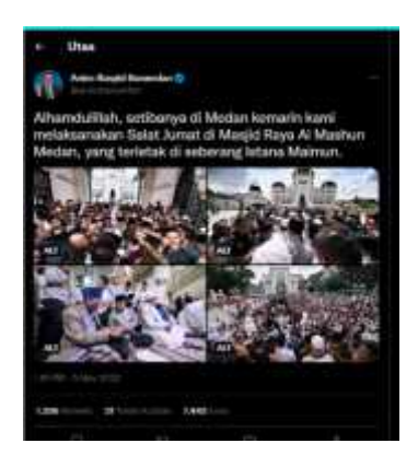
Figure 09: Text and religious symbols

In the next post, pictures 07, 08, and 09 describe symbols of religion. Religious symbols are presented with signs, such as; mosques, religious actors (da'i), Muslim clothing, and religious activities. Religious nuances become an emphasis on the images displayed in the post. The representation of the meaning contained in that Anies Baswedan wants to show good relations with various religious groups and leaders. In addition, the connotative meaning