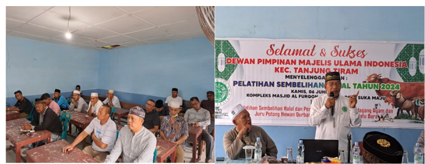
Figure 2 : The Speaker and Training Participant

The importance of ethics in the animal slaughter process extends beyond ensuring halal compliance; it also encompasses values of humanity and animal welfare. Conducting slaughter in accordance with ethical principles and religious teachings ensures that animals are treated with respect and spared unnecessary suffering. Education on ethical slaughter practices, as delivered by the speaker, plays a crucial role in teaching the correct and humane ways to slaughter animals. The following image illustrates one of the training sessions that emphasized the significance of ethics in animal slaughter.