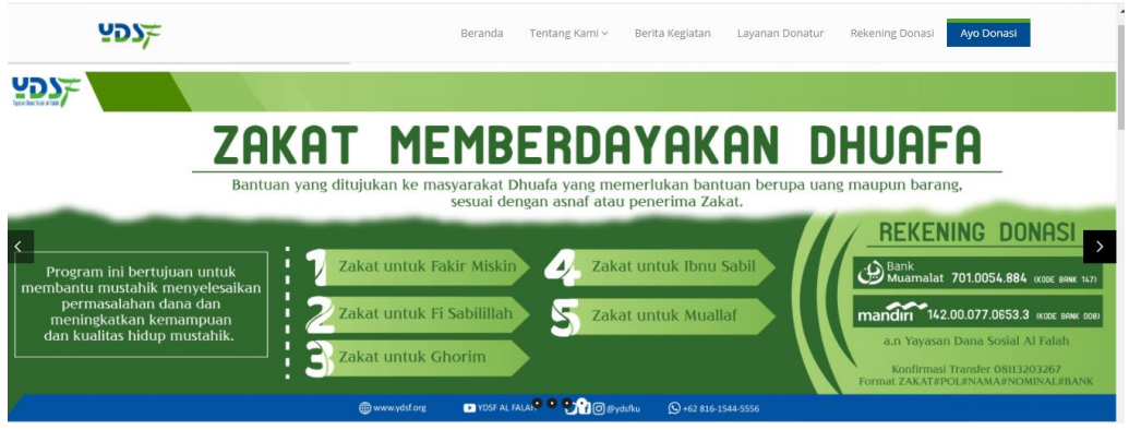
Figure 3. Recipients of Zakat at YDSF

According to Rumah Zakat (2019), zakat recipients comprise only around six ashnaf /groups, namely: al-fuqara, amil, fi sabilillah, muallaf, gharimin, and ibn sabil. The needy ( al-masakin ) and riqab groups are not included, even though al-masakin can be included in the category of fakir . Likewise, at Yayasan Dana Sosial al-Falah (YDSF), riqab is not listed as part of the mustahiq .